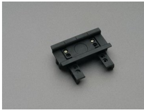
32950 mounting rail 72 mm for busbar adapters